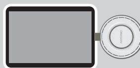
Plug & Play